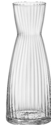
CARAFFA 50 cl CARAFE 16 7/8 oz

104 cl - 35 1/8 oz Raso Bocca – Brimful h 225 mm - 10" Max Ø 102 mm - 4" CT6 - Q.P. 216 10000011688