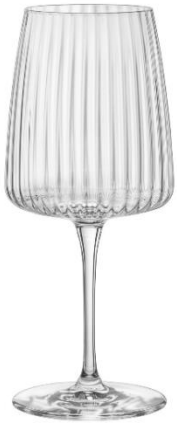
MERLOT RED WINE

53,5 cl – 18 1/8 oz h 216 mm - 8 1/2" Max Ø 92 mm - 3 5/8" B6 K4 – Q.P. 384 3.49788 SR4 K6 – Q.P. 384 10000005038