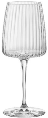
CHARDONNAY WHITE WINE

53,5 cl – 18 1/8 oz h 216 mm - 8 1/2" Max Ø 92 mm - 3 5/8" B6 K4 – Q.P. 384 3.49788 SR4 K6 – Q.P. 384 10000005038