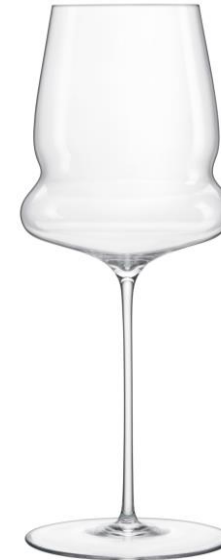
WHITE WINE TASTING RM544 66 cl – 22 3/8 oz h 26 cm – 10 1/4" Max Ø 10,6 cm – 4 1/8" GP2K3• Q.P. 162 Cod. 10000014005