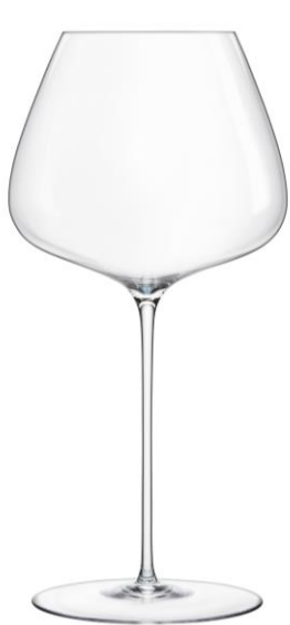
BURGUNDY RM540 87 cl – 29 3/8 oz h 25 cm – 9 7/8" Max Ø 12,2 cm – 4 3/4" GP2K3• Q.P. 108 Cod. 10000013985