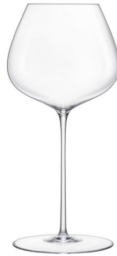
CABERNET/MERLOT RM541 68 cl – 23 oz h 24 cm – 9 1/2" Max Ø 11,2 cm – 4 3/8" GP2K3• Q.P. 108 Cod. 10000013989