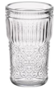
BICCHIERE ACQUA WATER TUMBLER 35 cl – 11 7/8 oz h 128,5 mm -5 " Max Ø 78,3 mm – 3 1/8" CT6 - Q.P. 882 10000012156