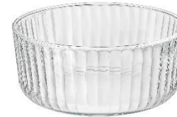
COPPETTA 15 SMALL BOWL 15 82 cl - 27 3/4 oz h 65 mm - 2 1/2" Max Ø 150 mm - 5 7/8" CT6 - Q.P. 462 ⓘ 10000012726