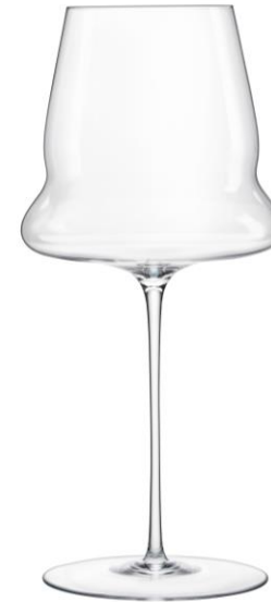
RED WINE TASTING RM543 77 cl – 26 oz h 25,6 cm – 10 1/8" Max Ø 11,8 cm – 4 5/8" GP2K3• Q.P. 108 Cod. 10000014001