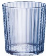
NEGRONI SAPPHIRE BLUE 35,5 cl - 12 oz h 89,5 mm - 3 1/2" Max Ø 85 mm - 3 3/8" B12 - Q.P. 1.200 ⓘ 10000011289