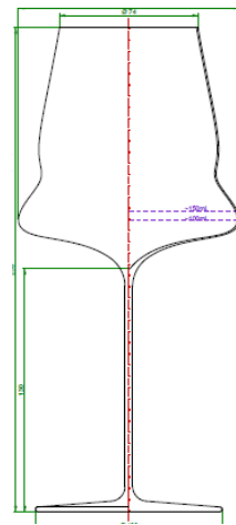
Red Wine Tasting 77 cl