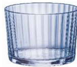
RUM SAPPHIRE BLUE 21,5 cl - 7 1/4 oz h 59 mm - 2 1/4" Max Ø 82 mm - 3 1/4" B12 - Q.P. 2.016 ⓘ 10000011277