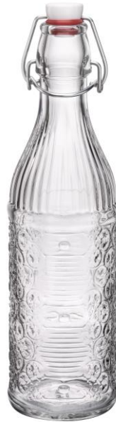
BOTTIGLIA 50 CL BOTTLE 16 7/8 OZ 52 cl – 17 5/8 oz H 253,8 mm - 10" Max Ø 72,9 mm – 2 7/8" CT6 T-BCO - Q.P. 600 Hermetic stopper in plastic with silicone gasket. 10000012151