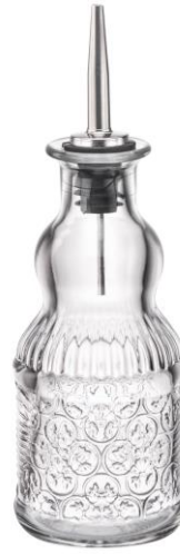
BOTTIGLIETTA 25 CL SMALL BOTTLE 8 1/2 OZ 27,5 cl - 9 1/4 oz h 165,6 mm – 6 1/2" Max Ø 72,9 mm – 2 7/8" CT12 C/VERS - Q.P. 576 Silicone and stainless steel pourer. 10000012154