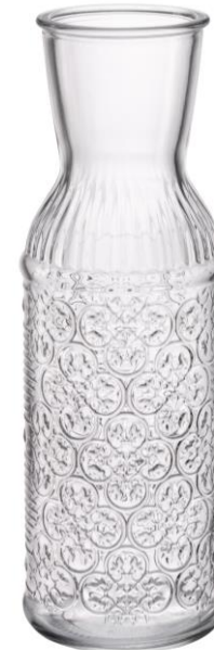
CARAFFA 100 CL CARAFE 33 7/8 OZ 113 cl – 38 1/4 oz h 277 mm – 10 7/8" Max Ø 91,5 mm – 3 5/8" CT6 - Q.P. 288 10000012159