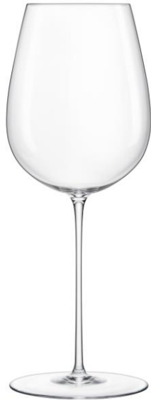
BORDEAUX RM539 72 cl – 24 3/8 oz h 26,2 cm – 10 3/8" Max Ø 9,8 cm – 3 7/8" GP2K3• Q.P. 162 Cod. 10000013981