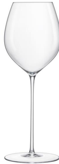
CHARDONNAY RM542 50 cl – 16 7/8 oz h 25 cm – 9 7/8" Max Ø 9,2 cm – 3 5/8" GP2K3• Q.P. 162 Cod. 10000013997