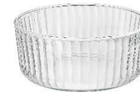
COPPETTA 12 SMALL BOWL 12 40 cl - 13 1/4 oz h 52 mm - 2" Max Ø 120 mm - 4 3/4" CT6 - Q.P. 972 ⓘ 10000012731