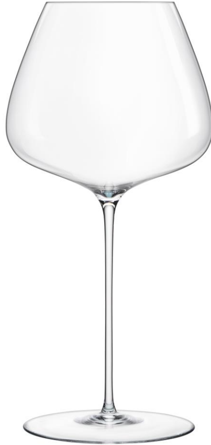
Burgundy 87 cl