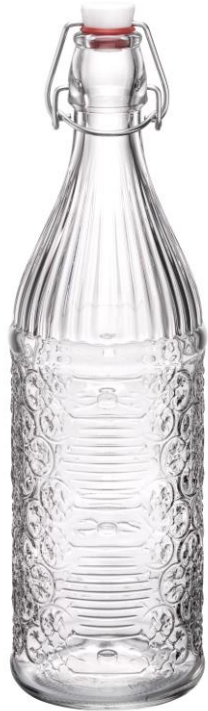
BOTTIGLIA 100 CL BOTTLE 33 7/8 OZ 103 cl – 34 7/8 oz h 307 mm – 12 1/8" Max Ø 91,5 mm – 3 5/8" CT6 T-BCO - Q.P. 288 Hermetic stopper in plastic with silicone gasket. 10000012147