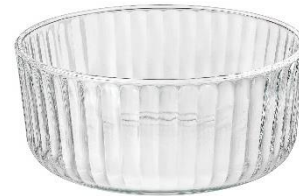
COPPA 18 BOWL 18 143 cl - 48 3/8 oz h 78 mm - 3 1/8" Max Ø 180 mm - 7 1/8" CT6 - Q.P. 288 ⓘ 10000012714