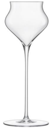
SPIRITS RM545 14 cl – 4 3/4 oz h 19,6 cm – 7 3/4" Max Ø 7 cm – 2 3/4" GP2K3• Q.P. 288 Cod. 10000014011