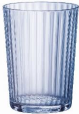
GIN FIZZ SAPPHIRE BLUE 50 cl - 16 7/8 oz h 120 mm - 4 3/4" Max Ø 88,5 mm - 3 1/2" B12 - Q.P. 864 ⓘ 10000011279